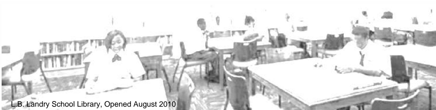
L.B. Landry School Library, Opened August 2010