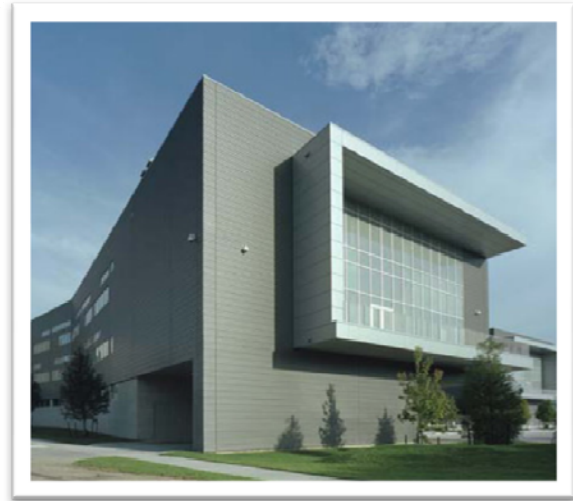
L.B. Landry School, Opened August 2010

With the current and future needs of the community in consideration, the goal of master plan is to rebuild in the most equitable and cost-effective manner possible.