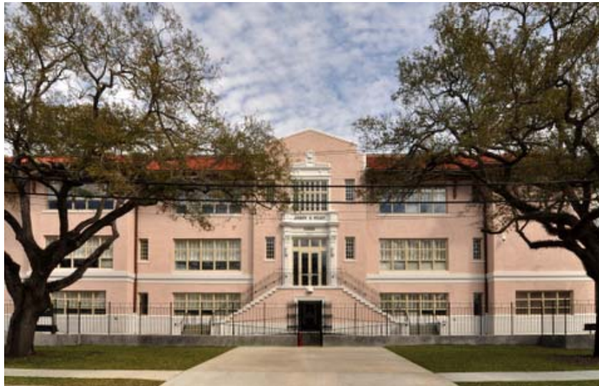
Andrew Wilson School, Opened January 2010