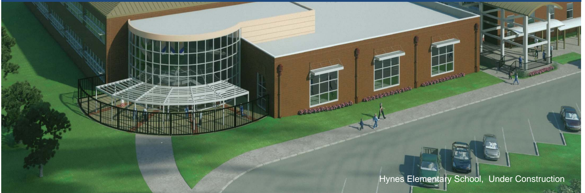
Hynes Elementary School, Under Construction